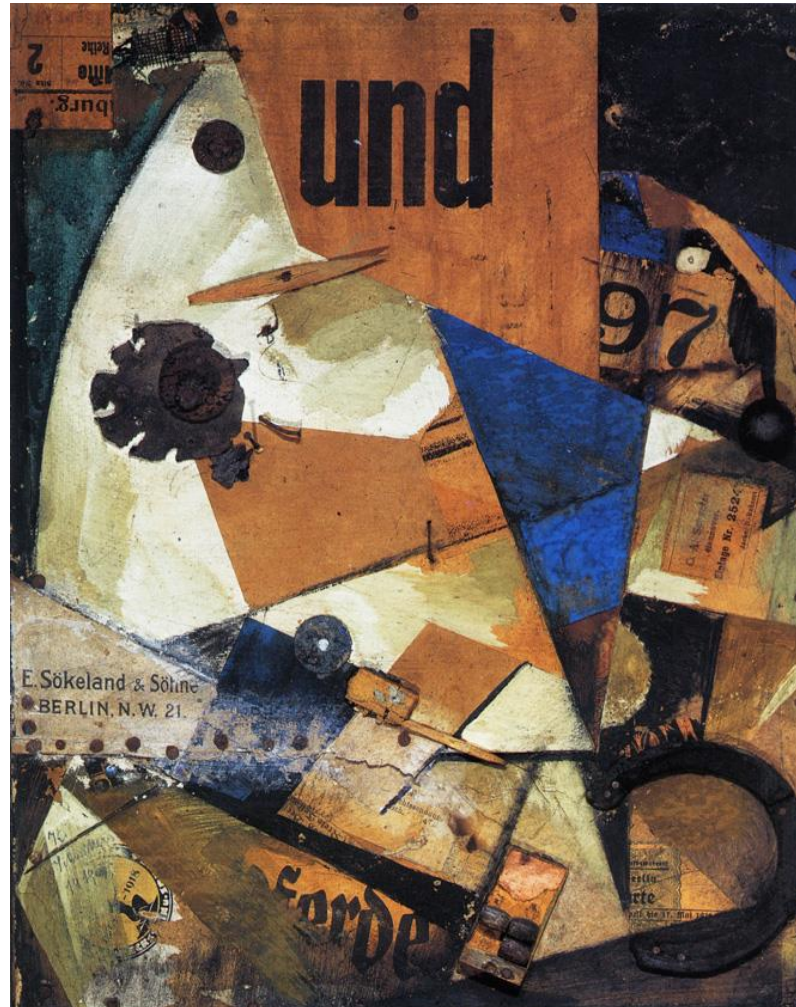
Kurt Schwitters, The Painting/Collage Das Unbild, 1919 ("The And-Picture")

A collage may sometimes include newspaper clippings, ribbons, bits of colored or handmade papers, portions of other artwork or texts, photographs and other found objects, glued to a piece of paper or canvas. The origins of collage can be traced back hundreds of years, but this technique made a dramatic reappearance in the early 20th century as an art form of novelty.