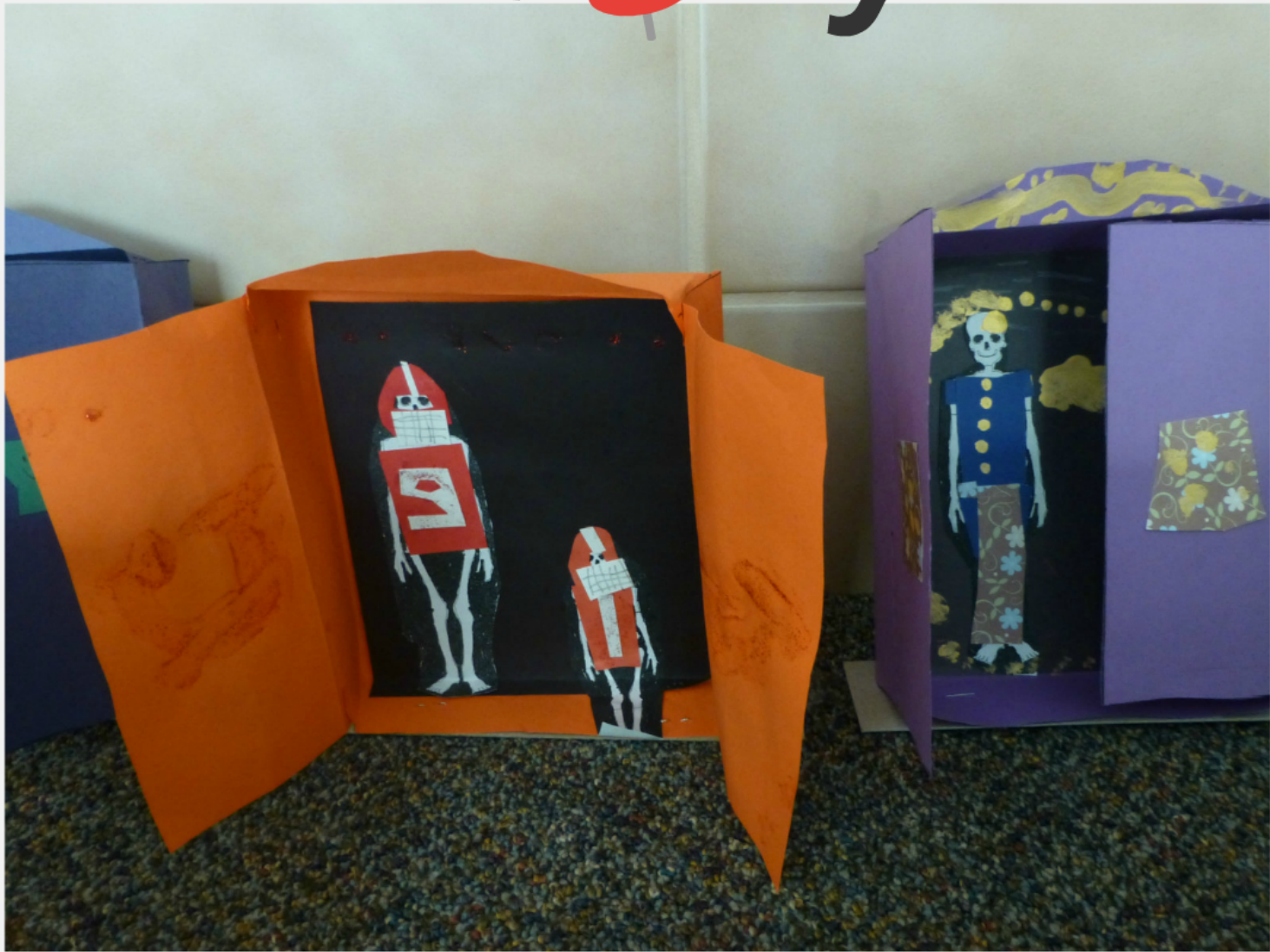
3D Paper Pop-up